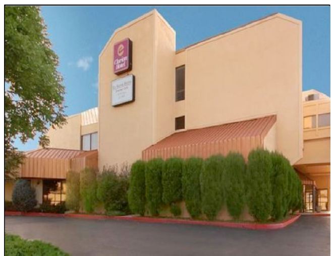
Hotel Clarion and Conference Center