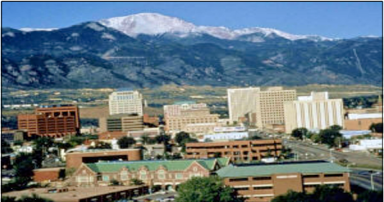
Downtown Colorado Springs Site of the USS Cusk 2010 reunion August 15-19, 2010

There are a few 2010 Reunion pictures out on the Cusk Website with more coming soon ( http://www.uscusk.com or http://www.uscusk.com/2010%20Reunion.htm ) Would welcome any pictures you might like to send.