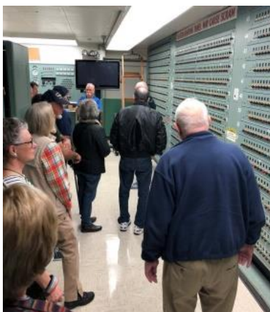
Control Room reactor monitoring