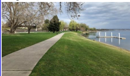
Columbia River and walkway next to our hotel