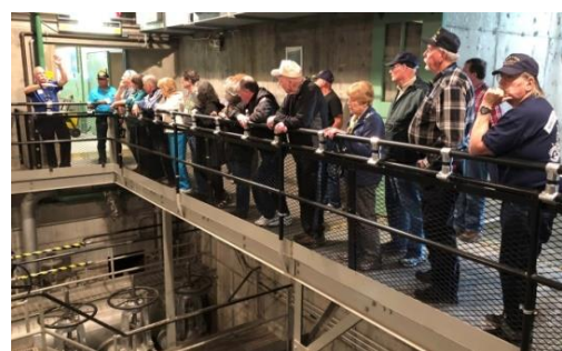
Some of the reactor pumps and valves