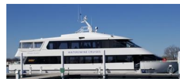
Our Water to Wine Cruise Ship

Water to Wine Cruise: One of the reunion highlights was luncheon cruise down the picturesque Columbia River aboard a beautiful yacht. The service and food were excellent and the boat was equipped with a comfortable dining room and bar.