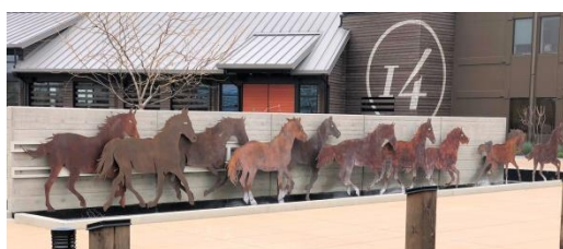
14 Hands Winery