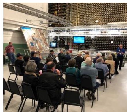
Room housing the Reactor Core