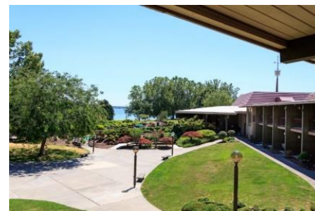
Courtyard area at the Red Lion Inn