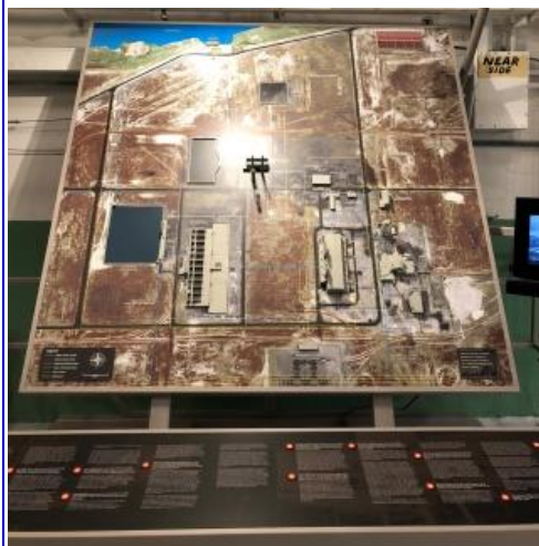
Scale model of Hanford Grounds & Buildings