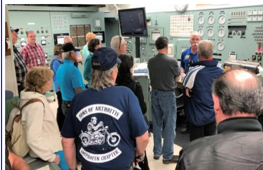
Main Control Room