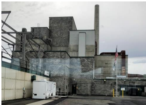
Exterior of Reactor Building