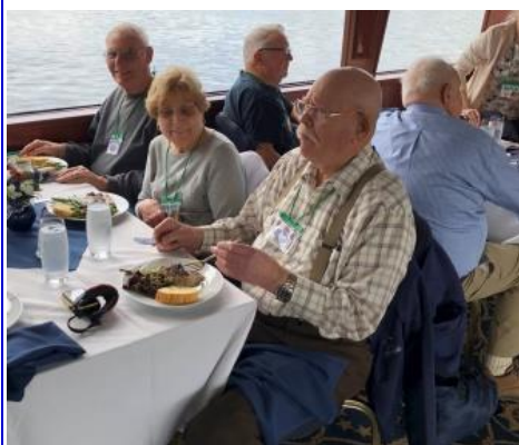
Great food, stories and companionship