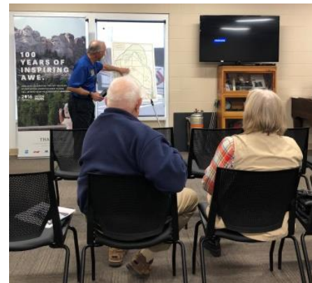
Our tour guide was a former submariner