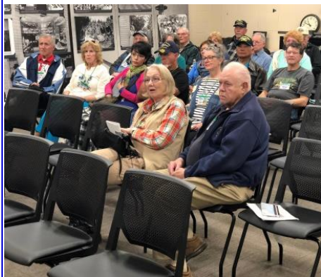
Pre-Tour briefing at Hanford Visitor's Center

Manhattan Project National Historical Park and Hanford Reactor: The Hanford Reactor site was definitely the highlight of the reunion. Without exception, everyone was astounded by this massive government project which created the weapons that ended World War II. Starting with a letter from Albert Einstein recommending the project (we each received a copy), this incredible facility was built and became capable of producing weapons of mass destruction in just four years.